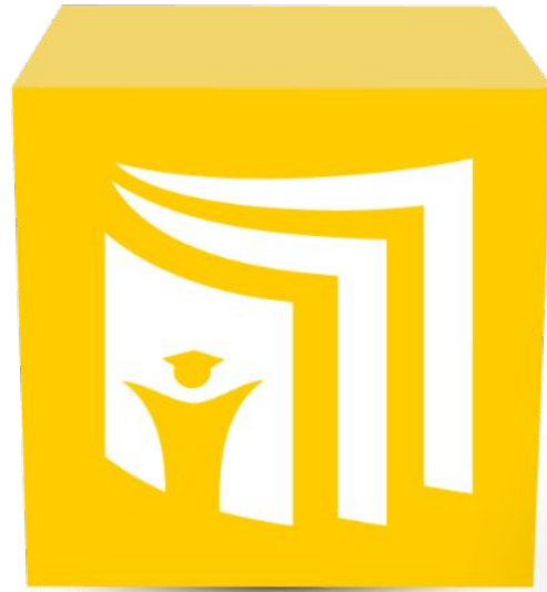
TEACHING & LEARNING