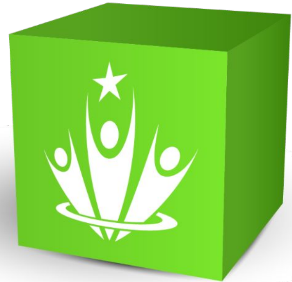
COMMUNITY PRIDE AND CONNECTION